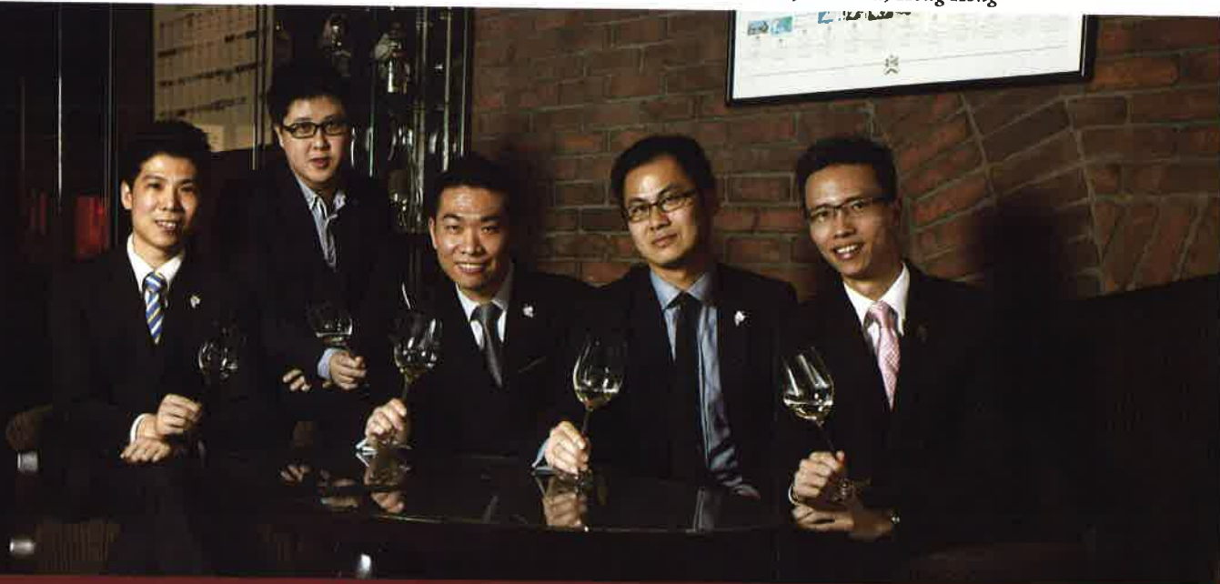
WINE.Luxe Present - Monthly Blind Tasting Challenge

Sheraton Hong Kong Hotel And Towers Location: 20 Nathan Road, Tsim Sha Tsui, Kowloon, Hong Kong