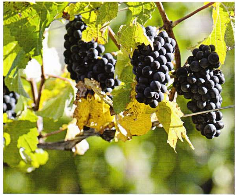
▲ Pinot noir grapes at Misha's Vineyard ready for harvesting. There are eight clones of pinot noir on Misha's Vineyard in order to create complexity in the wines.