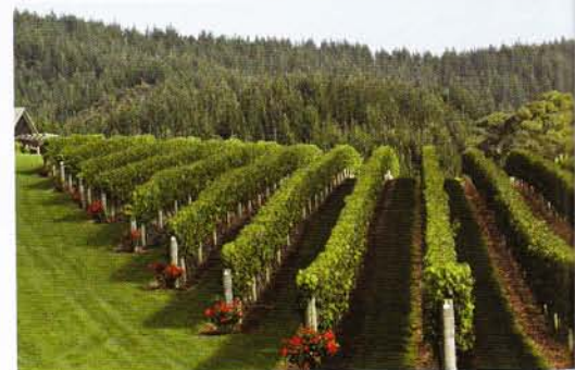
▲ Puriri Hills vineyard in Clevedon, Auckland.